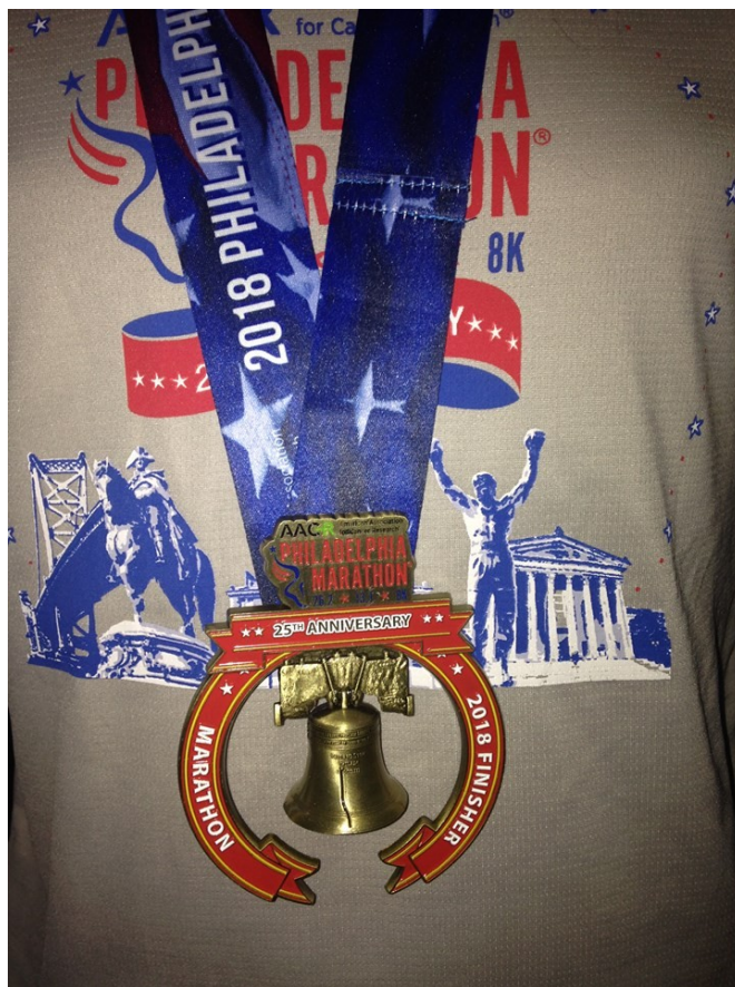
Philadelphia Marathon 2018 Finishers Medal and T-shirt

Each new neighborhood brought a new style of crowd support, each as enthusiastic as the last. South St. was filled with cheering families and lots of little hands to high five, then there were DJ's mixing beats, followed by a gospel choir and band plugged in outside their church. The Drexel campus offered students outside tossing footballs (Fly Eagles Fly) outside frat houses. Then we started the longest climb of the race and my spirits were raised by a group of guys in front of me who broke into the theme from Rocky and kept it up until the course flattened out again. (Continued on Page 4)